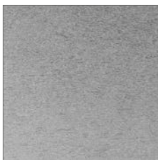
Stainless steel appearance